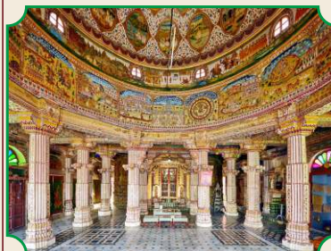
Bhandasar Jain Temple

Bikaner is located in the North Western region of Rajasthan and is famous for its rich cultural heritage, historic forts, palaces, temples and sand-dunes. The city was founded in the late 15 th century by Rao Bikaji, a Rajput prince, and is named after him. Bikaner is famous for its cuisines, snacks and sweets like Rasgullas, Bikaneri bhujia, and Kachoris. The city is also known for its intricately carved temples, such as the Karni Mata Temple, which is famous for its large population of rats, and Laxmi Nath Temple, built in 15 th century and is dedicated to Lord Vishnu. Bikaner is also home to several historic forts, palaces and havelies, including the Junagarh Fort, which was built during the 16 century and houses several palaces and temples within its walls. The city is also known for its handicrafts, particularly its Usta-art, leatherwork, and carpets. Today, the city is thriving on its rich cultural heritage, supply of sweets, namkeens and attracts visitors from all over the world who come to explore its history, culture, and cuisines.