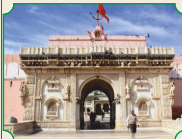
Karni Mata Temple