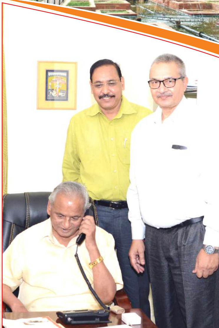
Inauguration of RAJUVAS Toll-Free Helpline Service by Hon'ble Governor of Rajasthan and Chancellor Sh. Kalyan Singh at Jaipur