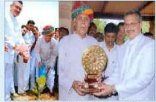
Hon'ble Sh. Harji Ramji Burdak, Minister for Agriculture, Animal Husbandry, Fisheries, Govt. of Rajasthan planted the Ficus tree symbolic to establishment and growth of new University on 26 th January, 2010.