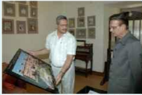
His Excellency Sh. Shivraj V. Patil, Chancellor of this University and Governor of Rajasthan appreciating the building of the University.