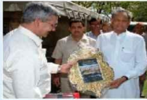
Hon'ble VC presenting a memento to Hon'ble Chief Minister of Rajasthan, Sh. Ashok Gehlot as a mark of respect.