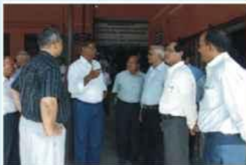
Three Vice-Chancellors of Gujarat Agricultural Universities visiting RAJUVAS