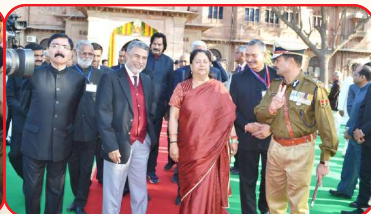
Hon'ble Governor of Rajasthan Sh. Kalyan Singhji, Hon'ble Chief Minister of Rajasthan Smt. Vashundhara Raje and other dignitaries at RAJUVAS on the occasion of Republic Day "At Home" function